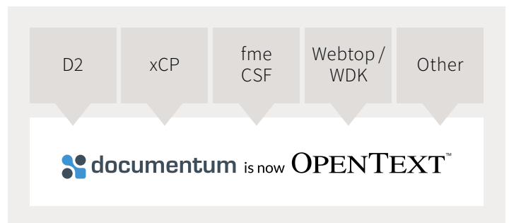
Possible clients for the OpenText Documentum platform